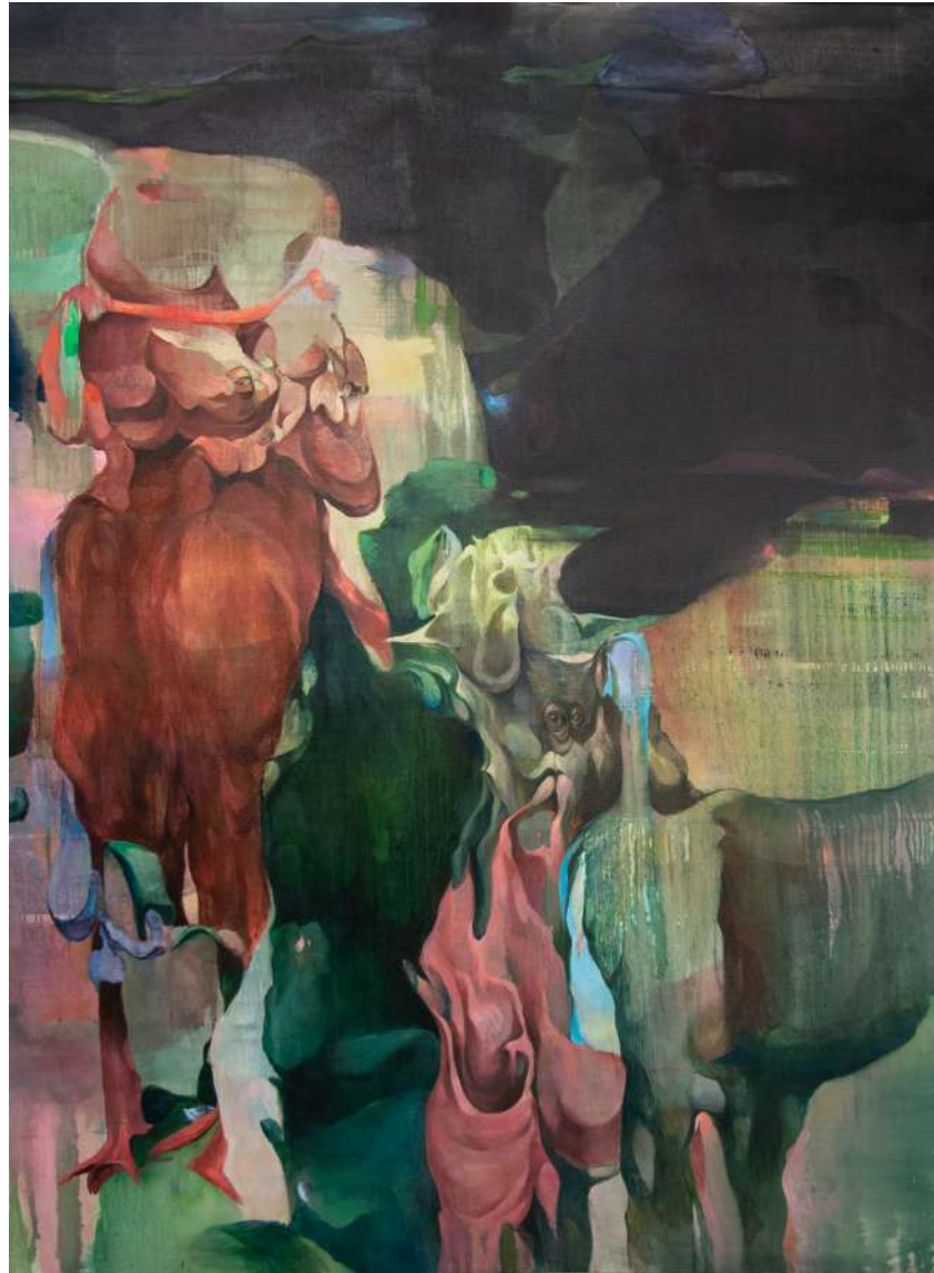
Daria Dmytrenko Deep forest creatures , 2022 Oil on linen 140 x 190 cm | 55 x 75 in