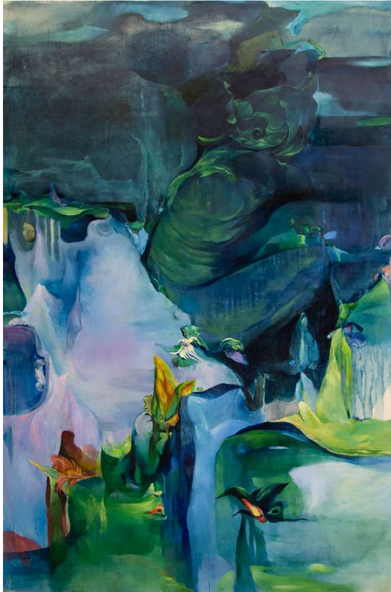
Daria Dmytrenko Spirit of the Blue Swamps , 2022 Oil on canvas 135 x 195 cm | 53 x 77 in