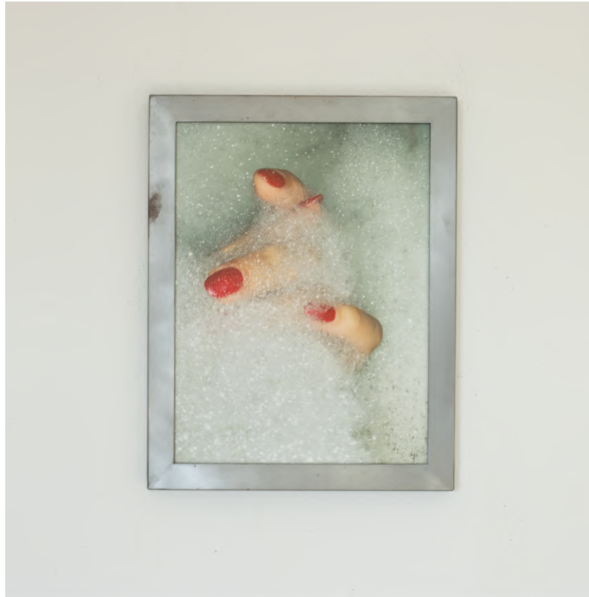
Nataliya Chernakova Bubble Bath , 2021 Archival inkjet print on Hahnemühle paper mount on aluminum, custom steel frame, museum glass Edition 3 45.6 x 35.6 x 2.7 cm | 18 x 14 x 1 1/16 in