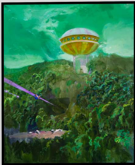
Bogdan Koshevoy Zvezdnij Teleport , 2022 Oil on linen 85 x 70 cm | 33 x 27 in