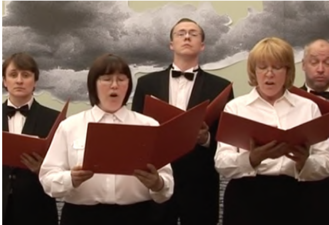
CHTO DELAT Perestroika Songspiel , 2008 Video Various sizes Edition 5 + 2 AP