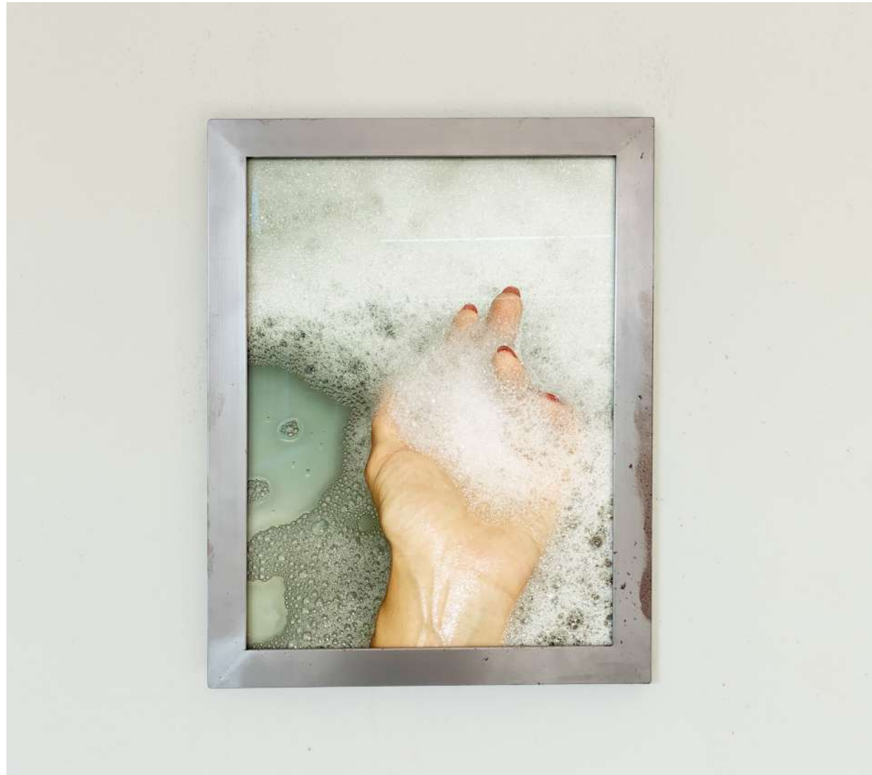
Nataliya Chernakova Bubble Bath , 2021 Archival inkjet print on Hahnemühle paper mount on aluminum, custom steel frame, museum glass Edition 3 45.6 x 35.6 x 2.7 cm | 18 x 14 x 1 1/16 in