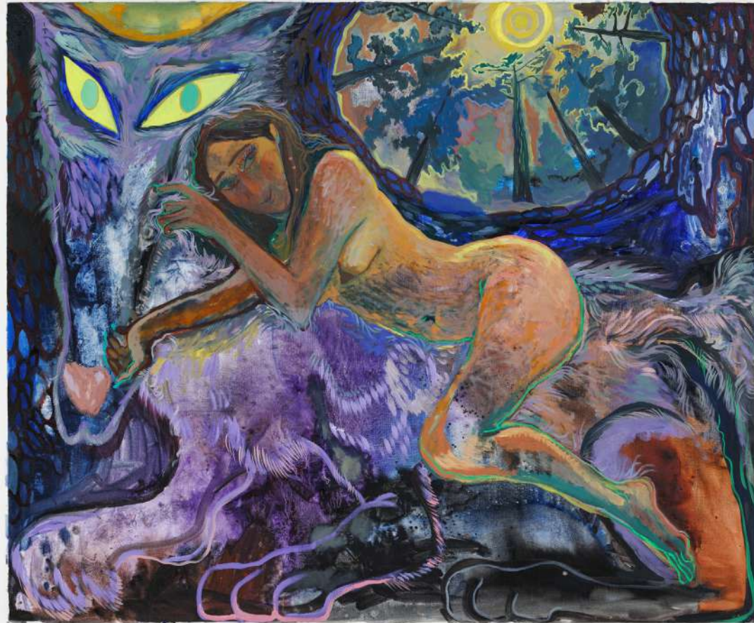
Victoria Kosheleva I love you , 2022 Oil on canvas 140 x 170 cm | 55 x 67 in