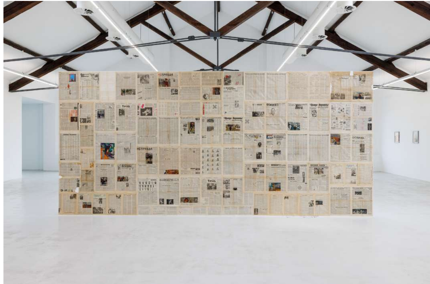
Vitaliia Fedorova Lions-Liars, Papa! , 2022 Newspapers of 90' (Soviet, post-soviet), markers on paper, print on translucent paper, paper tape, acrylic Variable size