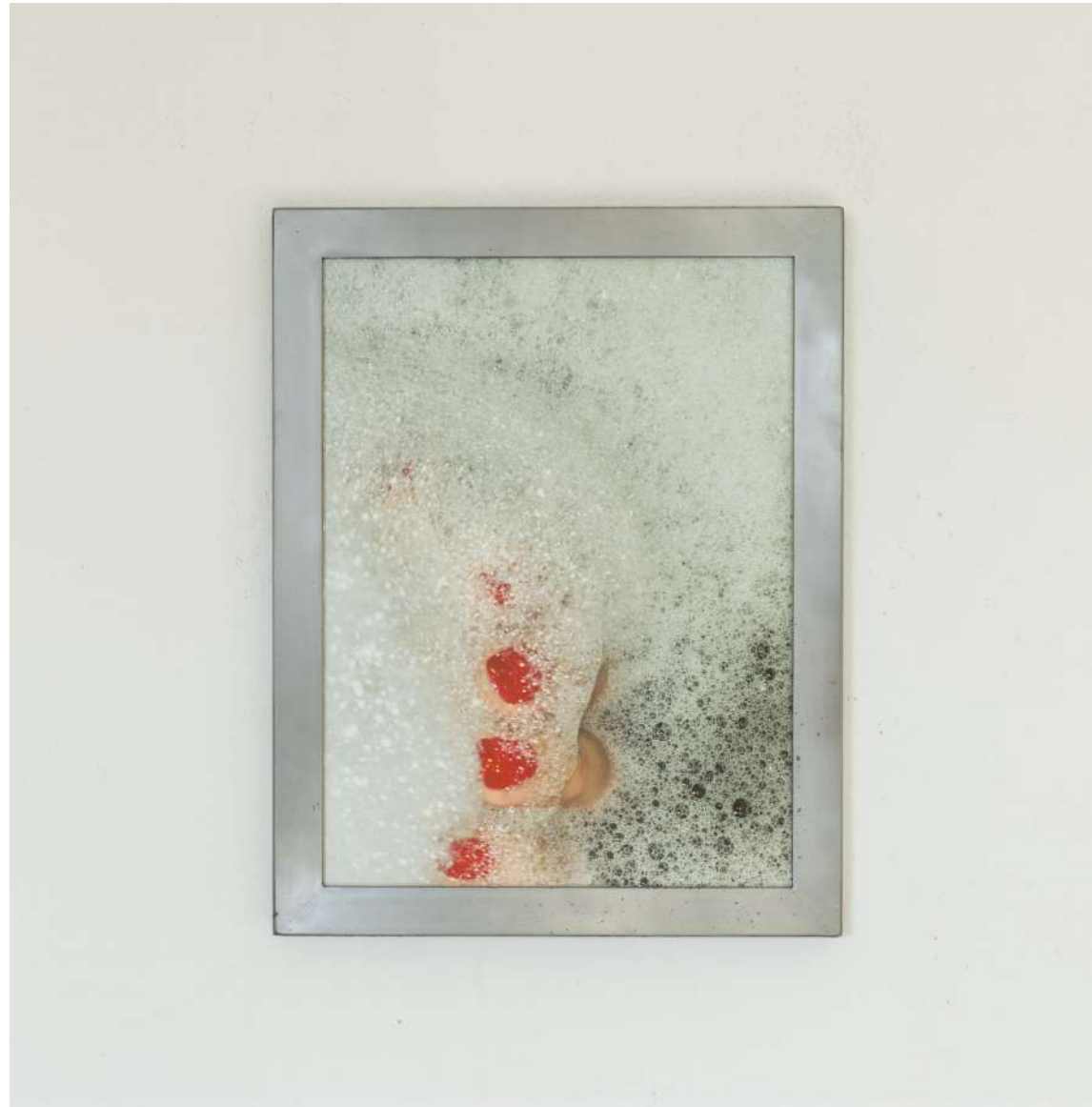
Nataliya Chernakova Bubble Bath , 2021 Archival inkjet print on Hahnemühle paper mount on aluminum, custom steel frame, museum glass Edition 3 45.6 x 35.6 x 2.7 cm | 18 x 14 x 1 1/16 in