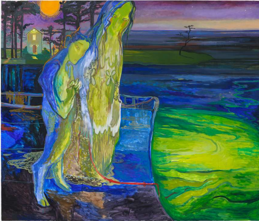
Victoria Kosheleva Forest Faun and EmberFromTheOven are sad. They drowned the Iphone in a big lake. But everything ended well, 2022 Oil on canvas 170 x 200 cm | 67 x 79 in