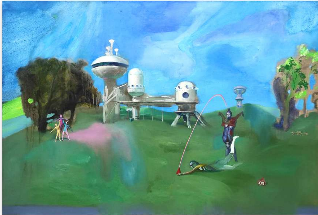
Bogdan Koshevoy White Zvezdnij , 2022 Oil on linen 100 x 150 cm | 78 x 59 in