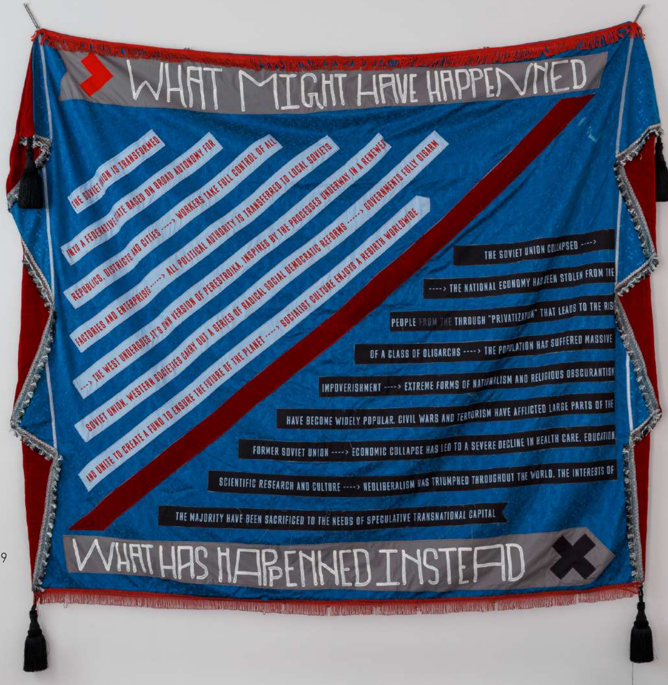
CHTO DELAT Perestroika Banner, version 1, 2019 200 x 220 cm | 79 x 86 in Mixed textiles (sewed), vinyl paint