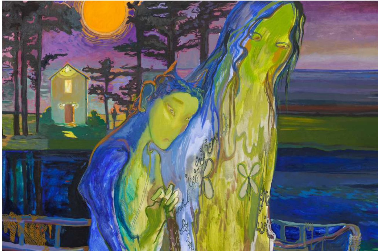
Victoria Kosheleva Forest Faun and EmberFromTheOven are sad. They drowned the Iphone in a big lake. But everything ended well, 2022